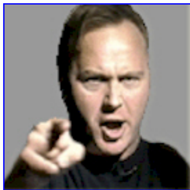
Alex Jones & 'Infowars' Monday through Friday on KCAA 1050-AM from 4:00 p.m.-5:00 p.m.

Alex Jones has created a powerful platform to restore freedom in the face of our security obsessed government. Jones is known for not just talking the talk, but walking the walk. On his weekday show, 'Infowars,' he com-