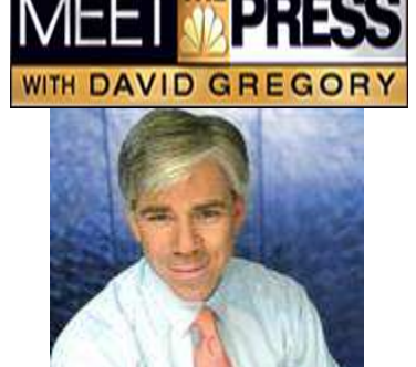
Sunday 9 AM